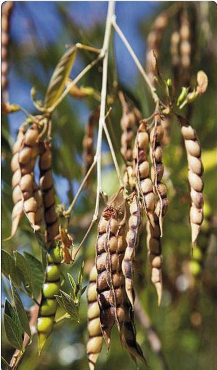
Clockwise from top, lettuce seed, pigeon peas and lemons are all grown in Nancy Redfeather's kitchen garden.

Of course, there already is a