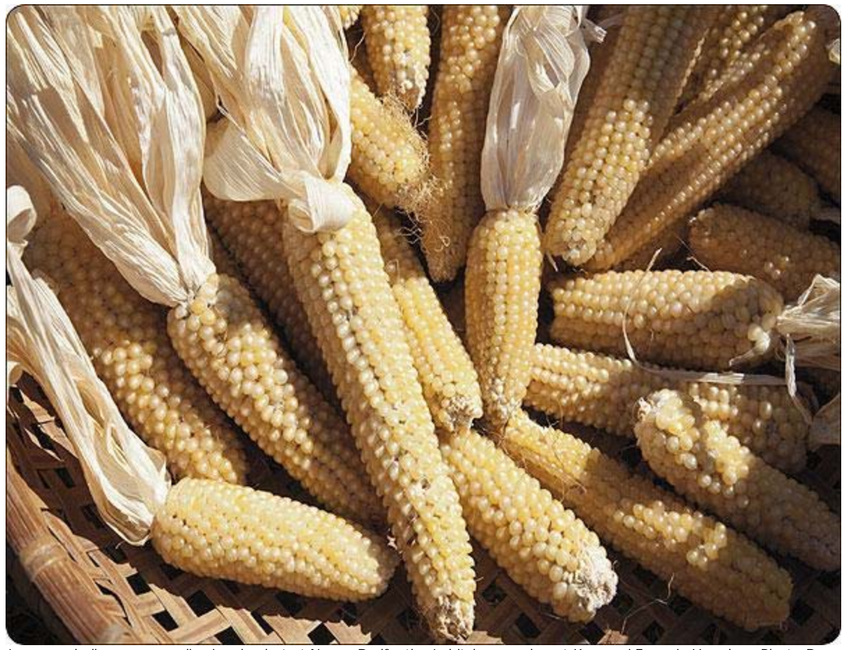
Japanese hulless popcorn lies in a basket at Nancy Redfeather's kitchen garden at Kawanui Farm in Honalo.