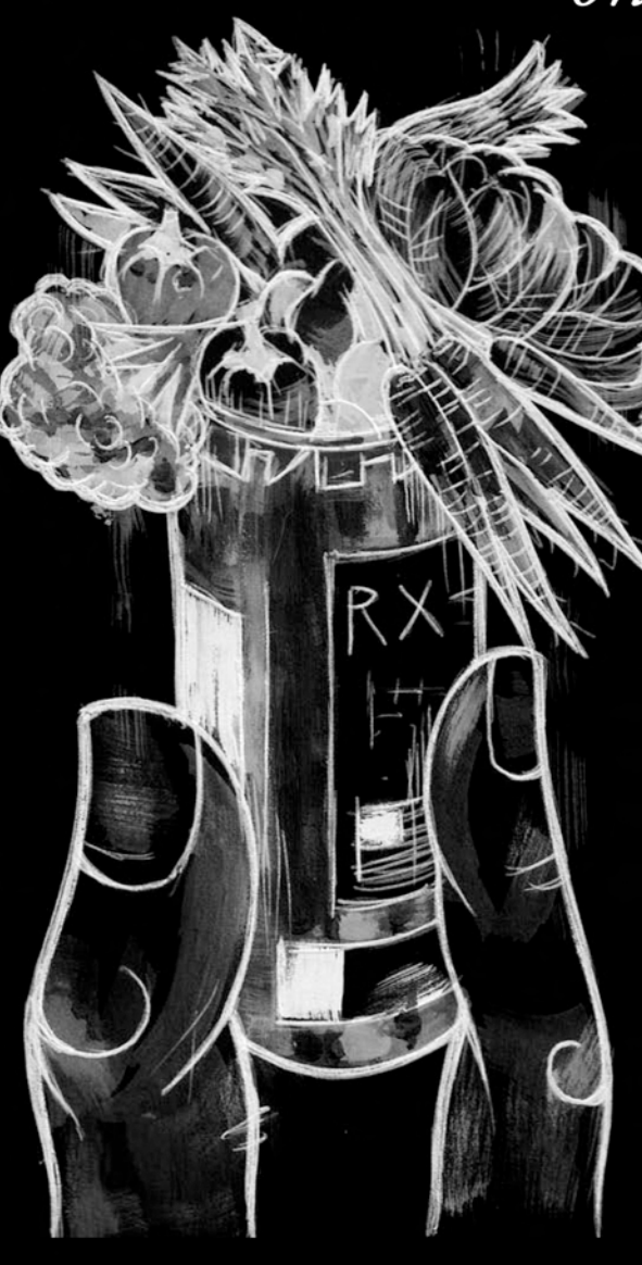
28 • November 2010

Reproduced with permission. Www.progressive.org