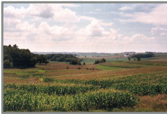
Farmland in the Driftless Region

As part of the FFI, VSN conducted an 18-month community food assessment of Vernon County to better understand the county's food assets, opportunities, and needs and to identify the best strategies for improving food security. In Vernon County, the community food assessment served as a foundation for stakeholders to identify projects, policies, and partnerships to meet the aforementioned goals of a sustainable food system."