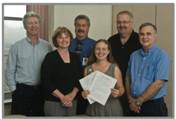
Six members of the Fifth Season Interim Board

offered invaluable guidance on budgeting, vision development, and cooperative governance.