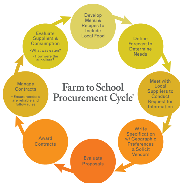
*Adapted from Hawai‘i Child Nutrition Programs’ Procurement Cycle Illustration

The state might also consider decentralizing the DOE’s School Food Services Branch by breaking the district into smaller food procurement units, such as counties, islands, school complex areas, school complexes, or communities.