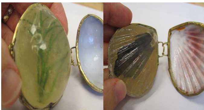
Two sided soaps made with shell molds

Rainwater was then poured over the ashes which wash out lye, in this case potassium hydroxide KOH). The lye was collected and poured into melted animal fat and stirred and heated for several hours over a fire. This is how soap was made for home use. The ash with the lye removed was then added to vegetable crops and is an excellent soil amendment. Today companies make several different types of soaps with different properties that are suited for bathing, laundry, and cleaning.